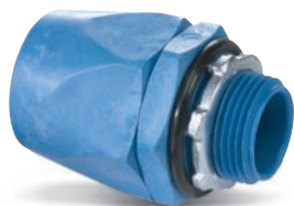
Type A Nonmetallic Liquidtight Connectors