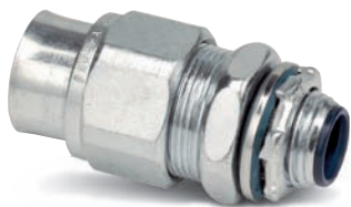
Type A Metallic Liquidtight Connectors