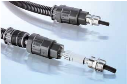
PMA EMC System providing electro-magnetic shielding.