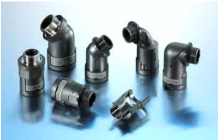
Fittings: PMAFIX IP68GT single piece fittings with integrated strain relief optimally holds and seals cables.