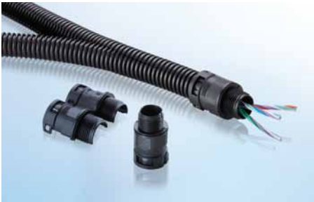
PMA Divisible System for retrofit and repairs.