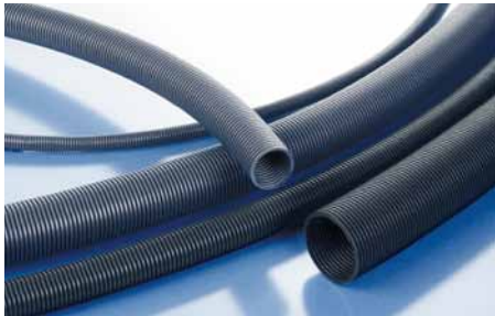
Conduits: PLR (PA6) and PCSL (PA12) conduits with high-grade, specially formulated polyamide. Very good flammability characteristics and mechanical performance.