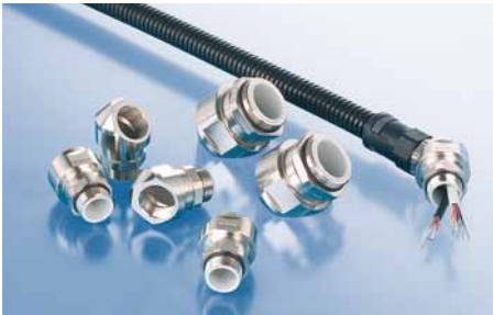
Accessories: Wide range available.