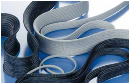
Braids F.66, C.66, L.66, F.PX, L.PX, G.PX for simple bundling and abrasion protection for cables and wires.