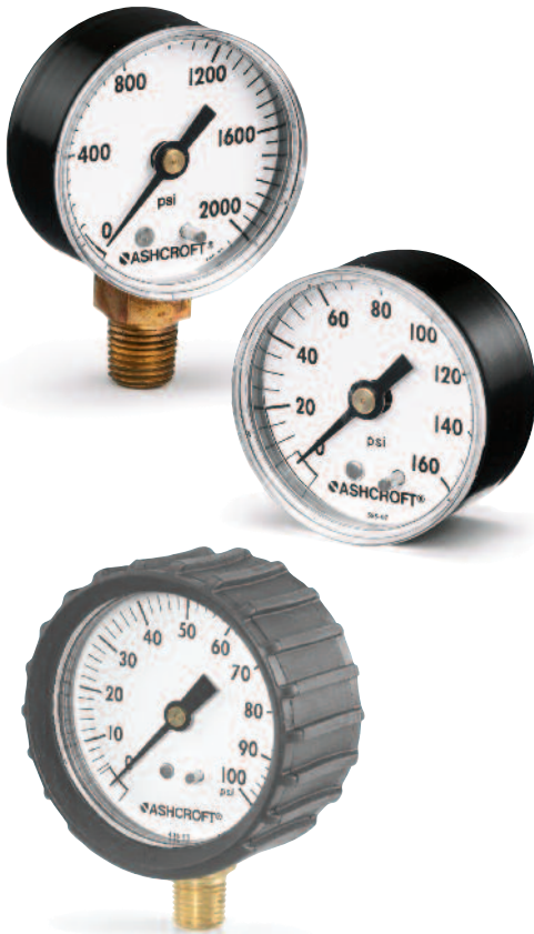
Shown with Optional Rubber Boot