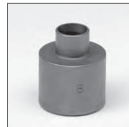
Fig. R99 — Body Die