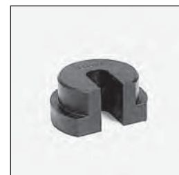
Fig. R100— Nut Die