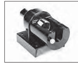
Fig. R95 — Hydra Tool

Dimensions and pressures for reference only, subject to change.