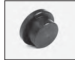
Fig. R96 — Ram Insert (Ferulok Only)