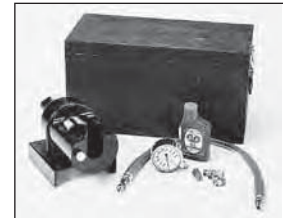
Fig. R98— Hydra-Tool Kit